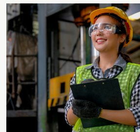
Greater employee comfort and productivity