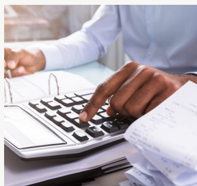
Reduced electricity bills

Energy-saving upgrades provide a number of benefits to your business, from boosting operational efficiency to keeping employees and customers more comfortable. Here are some of the benefits to participating: