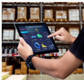
Up-to-date, efficient equipment and technology